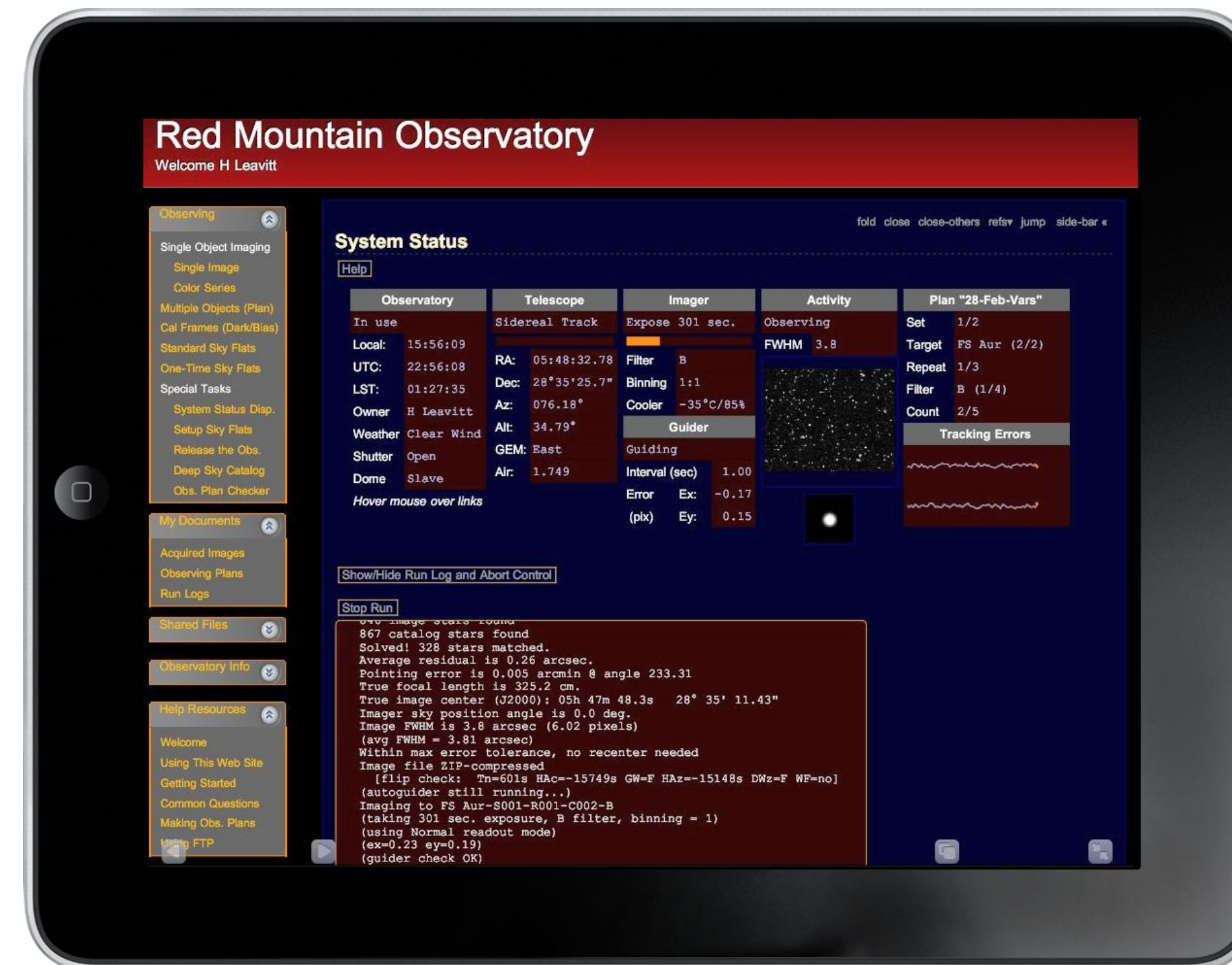
Live Remote Observing via ACP Expert Web Interface on Apple iPad