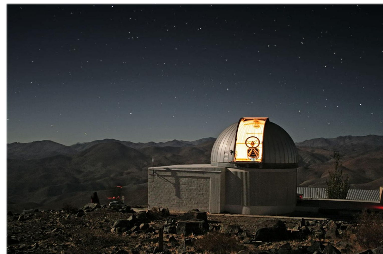
The TRAPPIST 0.6m remote/robotic telescope at ESO La Silla Observatory, Chile